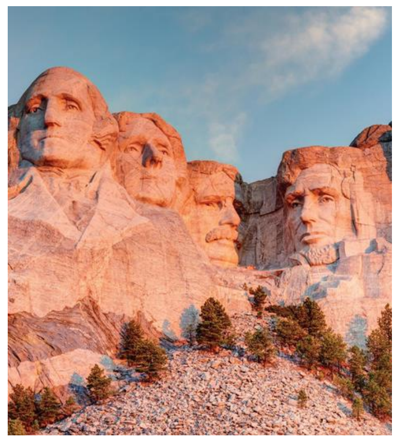
12 Days • 16 Meals: 10 Breakfasts, 6 Dinners

HIGHLIGHTS... Scottsdale, Grand Canyon, Lake Powell, Zion, Bryce Canyon, Salt Lake City, Jackson Hole, Grand Teton & Yellowstone National Parks, Old Faithful, Sheridan, Bighorn Mountains, Crazy Horse Memorial, Mount Rushmore